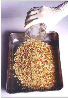
Making Fruit-Cereal Bar